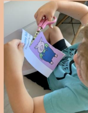
Practicing cutting skills