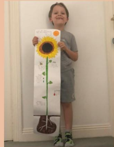
Life size life cycle of a sunflower