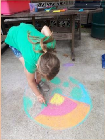
Showing a combination of Art, Science and Geography